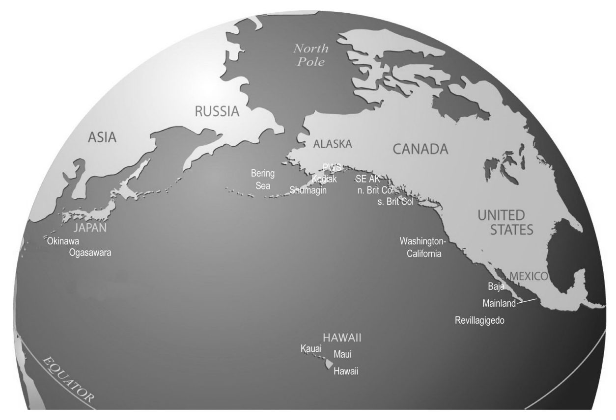
Fig. 1. Study area showing the locations where photographs were taken. PWS: Prince William Sound; SE AK: southeastern Alaska; n. Brit Col: northern British Columbia); s. Brit Col: southern British Columbia

A rake mark scar was defined as a set of 3 or more parallel lines or marks in close proximity. Lighting and exposure in photographs were critical to the visibility of faint scars. We coded fluke photographs for the presence of rake marks using 5 categories (Fig. 2): (1) rake marks with injuries that inflicted damage to the integrity of the fluke, (2) severe scarring (3 or more sets of rake marks), (3) 1 to 2 sets of rake marks present, (4) scratches that were possibly caused by killer whale teeth but did not meet the definition of 3 parallel lines in close proximity, and (5) no rake marks were visible.