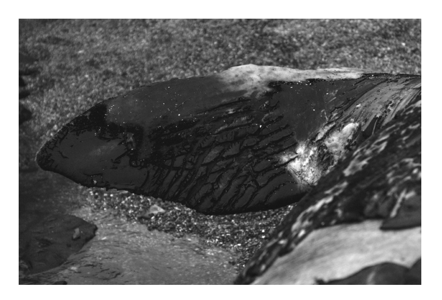
Fig. 4. Eschrichtius robustus. Pectoral flipper of a stranded gray whale that had been attacked by killer whales near False Pass, Alaska. Note the parallel cuts made by the teeth of killer whales. The other pectoral flipper, tail flukes, and lower rostrum of the whale were marked in a similar manner