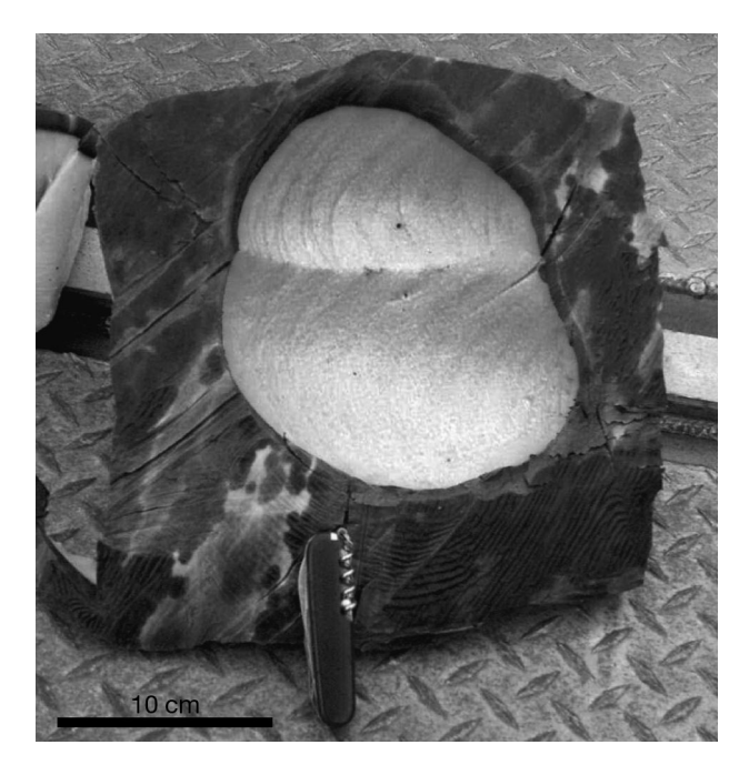
Fig. 3. Eschrichtius robustus. Portion of gray whale skin and blubber retrieved near feeding transient killer whales in the Unimak Island study area. The pit in the center is presumed to have been caused by a shark and has margins marked by fine grooves similar to those left by a serrated knife

On 12 occasions, we were able to examine floating portions that the killer whales had abandoned. All had ragged (torn) margins and were heavily marked with parallel cuts approximately 3.5 to 5.5 cm apart and 3 to 4 cm deep, which we attributed to the teeth of killer whales. Additionally, most had 1 to 5 cleanly cut dishshaped pits averaging approximately 14 to 20 cm in diameter and 5 to 10 cm deep (Fig. 3), which we attributed to Pacific sleeper sharks Somniosus pacificus. We based this on conversations with local fishermen, who reported bites of identical appearance on halibut caught on longlines along with by-caught Pacific sleeper sharks containing similar pieces of halibut tissue. Samples were taken from fragments of floating tissue while killer whales were feeding at 27 of the slicks; all were genetically identified as gray whales. On 4 occasions, substantial portions of carcasses with one or both pectoral flippers attached were seen. In each case, the trailing edge of the flipper was marked