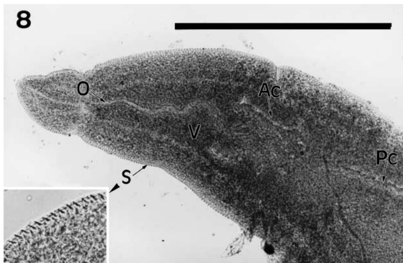
Fig. 8. Adult parasite obtained after kidney dissection and preserved in buffered formalin. Ac: anterior caecum; O: oesophagus; Pc: posterior caecum; S: spines (see detail, left bottom margin); V: vitellaria. Scale bar = 0.5 \mu m

Mild inflammatory responses and thrombi were occasionally observed in the endocardium and ventricular cavity of the affected fish although neither eggs nor adult parasites were detected in the heart of any of the fish examined. No obvious pathological alterations in relation to the parasite were observed in the other organs studied and bacteriology was negative.