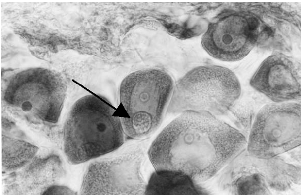
Fig. 2. Steinhausia mytilovum microsporidian infection (arrow) in the cytoplasm of a Mytilus galloprovincialis ovum

There was a significant difference in the CI of infected and non-infected females. The CI of infected females was significantly less than that of uninfected females (Fig. 3, 1-way ANOVA, F -ratio = 104,64, p -value = 0.0001).