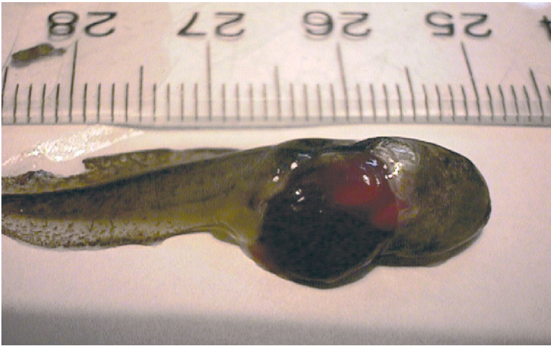
Fig. 1. Rana sylvatica . Example of a systemic hemorrhage

ity events involving more than 100 individuals in June of 1999, 2000 and 2001. More than 50 Rana sylvatica were found dead at the Kortright Pond in June 2001, and over 100 Rana pipiens metamorphs were found dead at Gannon's Narrows in August 2002. Necropsy observations included edema of the body cavity, poor fat body composition, pale and mottled colouration of the liver and systemic hemorrhage (Fig. 1). Cutaneous lesions and ulcers were not observed. In all mass mortality events, only 1 species of amphibian was involved despite the presence of a diverse amphibian community. In 4 events only tadpoles were infected, and these individuals ranged from Gosner stages 40 to 45 (Gosner 1960). Recent metamorphs were afflicted by only 1 mortality event, and no morbid or dead adults were observed at any of the locations. All 5 of the disease outbreaks in Ontario had onsets within a short time-frame between June and August. No mass mortality events were investigated between September and May. An accurate total number of individuals that succumbed to infection at each location is unknown. However, during 2000 and 2001 no new wood frog metamorphs were observed at the Oliver Pond. Also,