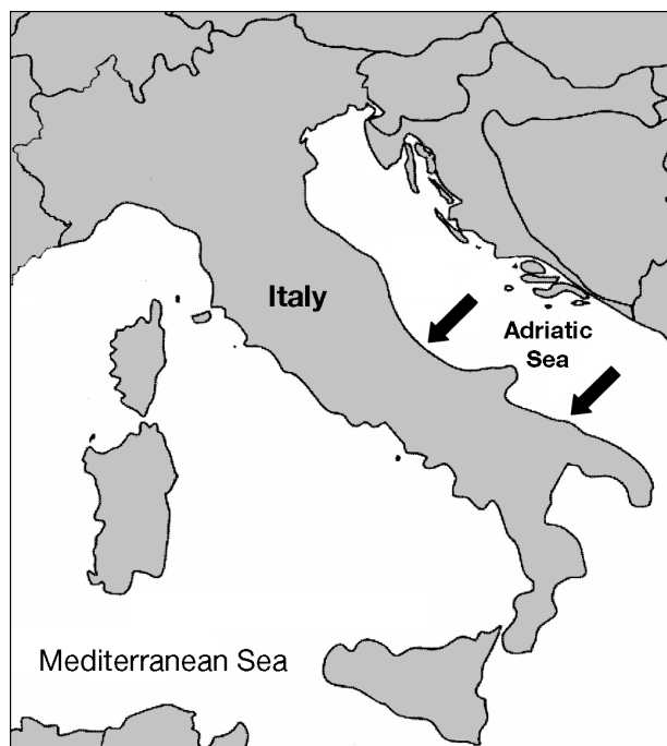
Fig. 1. Map of Italy showing the coast where sea turtles Caretta caretta were collected

Prior to analysis of the samples, aliquots of commercial homogenized sole, used as blanks, were extracted and analyzed to check for cross-contamination. In addition, aliquots of the homogenized sole, spiked with standard mixtures at several concentration levels (ranging from 1 to 500 ng g -1 ), were extracted and analyzed in triplicate to evaluate the recovery. The recovery rate was between 80 and 110%. Limits of quantification were: 1 ng g -1 for the 7 PCB congeners; 1 ng g -1 for p,p' -DDE, p,p' -DDD, p,p' -DDT, o,p' -DDT, alpha-endosulfan, beta-endosulfan, alpha-HCH, beta-HCH, and gamma-