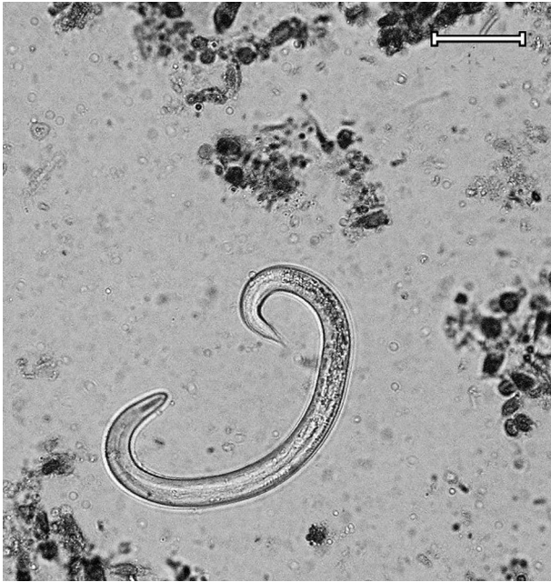
Fig. 3. Tursiops truncatus . Halocercus lagenorhynchi larvae from a tracheal swab (MML 0331; 40 \times ), scale bar = 30 \mu m

mature, with female worms present in all 4 dolphins and male worms present in 3 of the 4 dolphins. The intensity of infection ranged from 9 to 59 worms present in the bronchi and lungs of the 4 dolphins, with a geometric mean intensity of infection of 22.6 worms animal -1 .