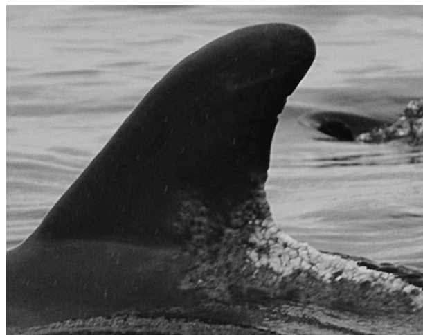
Fig. 3. Tursiops truncatus . Example of lacaziosis-like (LLD) lesions on a bottlenose dolphin from Charlotte Harbor, FL USA.