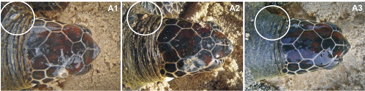
Fig. 1. Chelonia mydas . Individual with total regression of a tumor situated on the dorsal region of the neck. White circles show the fibropapilloma on 3 occasions: A1: first capture; A2: first recapture (after 22 d); A3: second recapture (after 164 d) demonstrating total regression of the tumor