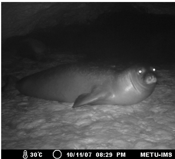
Fig. 1. Monachus monachus . Mediterranean monk seal appearing to react to the flash from the infrared camera. See 'Results' for details

The average haul-out times estimated for each individual and the variations between different photo traps are depicted in Fig. 2. When the flash was used, seals F1 and J1 stayed much longer on the haul-out platform than the other individuals, and the variations between haul-out times of these 2 individuals were the highest (Fig. 2). Seals F1 and J1 used the cave throughout the