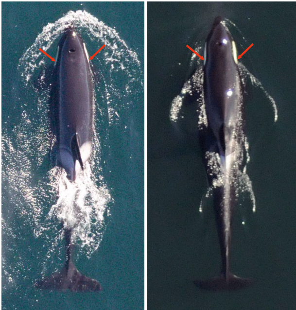
Fig. 1. K13, a robust 41.5 yr old female Orcinus orca (left) and L67, an emaciated 23.5 yr old female that subsequently died (right). Arrows show where head width (HW) measurement was taken at 15% of the distance between the blowhole and anterior insertion of the dorsal fin (BHDF). Note that the white eye patches of K13 angle outward towards the posterior, while the eye patches of L67 angle inward and follow the shape of the skull