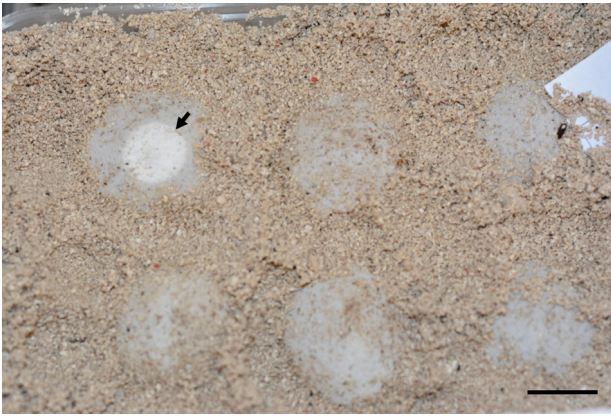
Fig. 1. Green sea turtle ( Chelonia mydas ) eggs 36 h post-oviposition, incubating in sand. Black arrow: a white spot that developed after oviposition and represents the first external sign of the resumption of active development of the embryo. The other eggs in the photo have not yet developed a white spot. The average diameter of C. mydas eggs is 41.2 \pm 1.19 mm (Limpus et al. 1984). Scale bar = 10 mm

the egg, and the lower pole or vegetal pole (VP), with the yolk, at the bottom. Carefully place the petri dish containing the egg under a dissection microscope and illuminate.