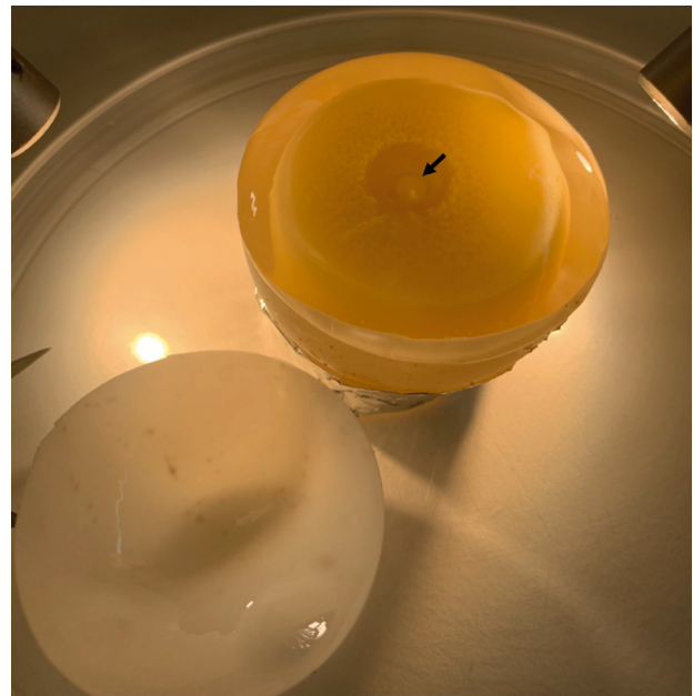
Fig. 3. Green sea turtle ( Chelonia mydas ) egg without the upper shell section and before the albumen has been removed (approx. 2 h after oviposition; Stage 6, Miller 1985). The embryo disk (black arrow) can be seen floating on the albumen

Step 2: As described in Step 2, Section 2.1.2. How-