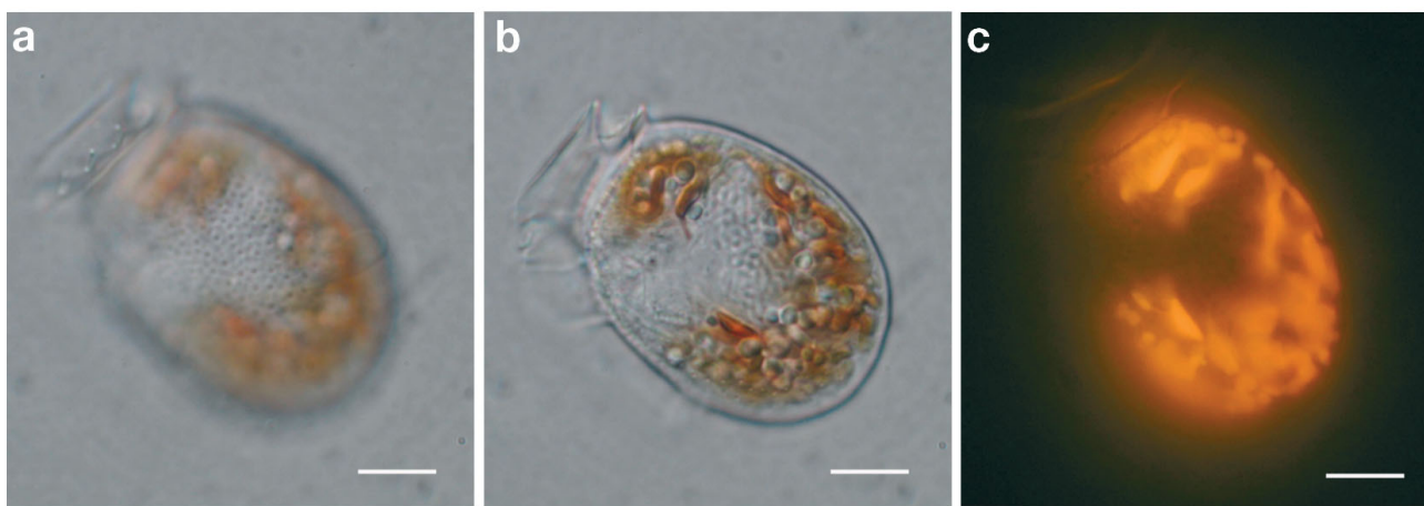
Fig. 3. Dinophysis acuminata . Typical light and epifluorescence micrographs of well fed cells using the ciliate prey Myrionecta rubra : (a) surface focus; (b) central focus; (c) epifluorescence of the same cell. Scale bars = 10 \mu m

Like Dinophysis acuminata , the planktonic ciliate Myrionecta rubra contains plastids of cryptophyte origin. The origin of the plastids has been proposed to be via kleptoplastidy following ingestion of the cryptophyte (Gustafson et al. 2000, Yih et al. 2004). Recently, however, Hansen & Fenchel (2006) have argued that the plastids of M. rubra are not kleptoplastids. They postulated, using morphological and experimental evidence, that M. rubra does not acquire chloroplasts from its cryptophyte prey; rather it feeds on cryptophytes in order to gain an essential growth factor for continuous growth. Similarly, D. acuminata may get its plastids as kleptoplastidy from ingesting M. rubra . If so, the plastids would be secondary kleptoplastids if Gustafson et al. (2000) and Yih et al. (2004) are correct about the origin of M. rubra plastids. If, however, Hansen & Fenchel (2006) are correct, then the plastids of D. acuminata would be primary kleptoplastids. Alternatively, D. acuminata may have its own plastids