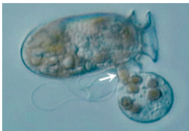
Dinophysis acuminata feeding on the marine ciliate Myrionecta rubra by extracting its cytoplasm through a peduncle.

The marine dinoflagellate genus Dinophysis includes both phototrophic and heterotrophic species and is globally distributed in coastal and oceanic waters (Hallegraeff & Lucas 1988, Hallegraeff 1993).