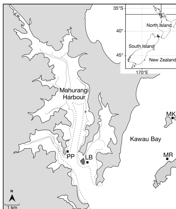
Fig. 1. Location of study sites in Mahurangi Harbour and Kawau Bay, New Zealand. LB: Lagoon Bay; PP: Pukapuka; MR: Motuora; MK: Motoketekete

This study was conducted in March and April 2019. Using SCUBA, benthic chambers (e.g. Lohrer et al. 2004, O'Meara et al. 2020) were placed within restored beds over sediments containing mussel clumps. To capture spatial variability and account for bed patchiness, a number of chambers without mussels (but within bed boundaries) were also deployed in this study. Chambers (0.25 m 2 each) were pushed into the sediment to a pre-marked line 7 cm from the chamber base, so that all chambers held 41 l of near-bed seawater at the start of the incubation. A total of 12 chambers were deployed at 3 sites (Motuora,