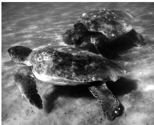
Fig. 4. Caretta caretta . Tactile stimulus by intruder to provoke resident response

pace. All aggressive confrontations involved sparring and 36% ( n = 4 ) progressed to close circling; of these 75% ( n = 3 ) progressed to chasing and biting before separation.