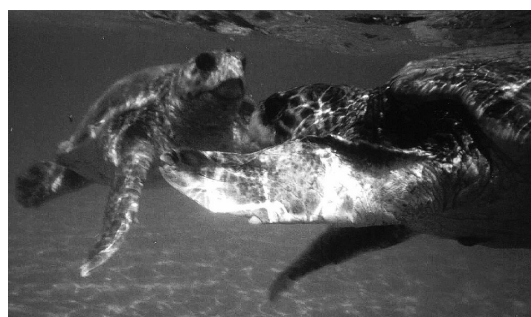
Fig. 5. Caretta caretta . Aggressive sparring between females

Separation was either mutual, with both turtles initially swimming away in generally opposite directions, or involved one opponent briefly chasing the other out of the immediate vicinity. Although the prehensile tail of adult male sea turtles has been documented to serve the primary function of curling under the female carapace for penile penetration (Miller et al. 2003), the present study noted that the prehensile tails of females used significantly often during confrontations ( \chi_1^2 = 3.89 , p < 0.04 ), possibly as a signal of the opponent's intention. In 70% ( n = 21 ) of passive and 80% ( n = 12 )