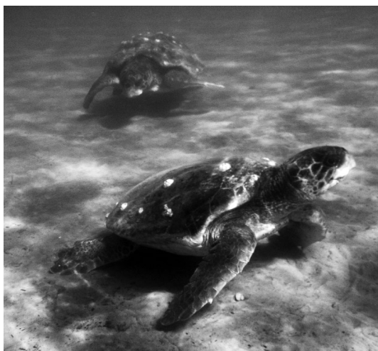
Fig. 3. Caretta caretta . Resident's visually provoked response to intruder