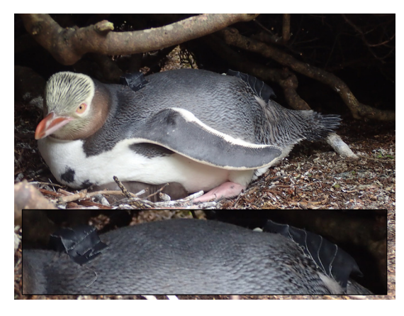
Fig. 2. Nesting yellow-eyed penguin with a time-depth recorder and very high frequency transmitter attached to the centre of the back, and a GPS logger attached to the lower back: inset shows close-up view. Enderby Island, Auckland Islands, New Zealand subantarctic.

Data loggers were deployed during late November and December, corresponding to the guard phase of breeding. GPS loggers were attached using waterproof tape (TESA) to the lower back to optimise streamlining (Bannasch et al. 1994) and orientation to the sky during the typical posture adopted during swimming or brooding (Muller et al. 2020a). For consistency, time-depth recorder (TDR) loggers were always taped to the centre of the back, below the