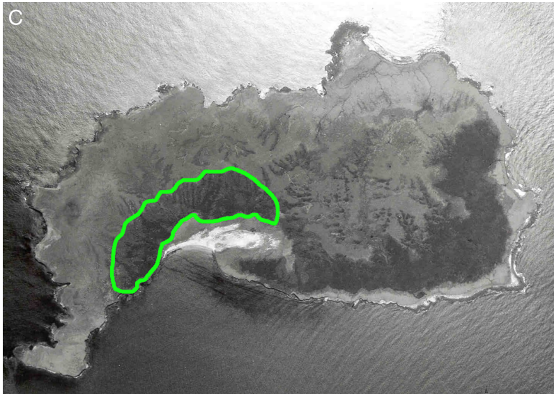
Fig. 1. (A) Breeding range of yellow-eyed penguins (green highlights) around the New Zealand mainland (northern population; above the dashed line) and in the subantarctic (southern population; below the dashed line). (B) Auckland Islands archipelago, with Enderby Island to the northeast (ca. 4.5 km wide, 50° 29′ 45″ S, 166° 17′ 44″ E). Selected depth contours are labelled in blue, from Mitchell et al. (2016). (C) Close-up of Enderby Island, showing the area where breeding birds were sampled (green). Modified from Fig. 1 in Muller et al. (2020a)

while some studies give a relatively good picture of what was happening during a particular time period and location, they may not represent the full range of foraging behaviour of the entire northern population. While diet studies in the 1990s showed occasional indications of pelagic foraging (van Heezik 1990, Moore et al. 1995), more recent dive data demonstrated a predominantly benthic foraging strategy for the mainland population (Mattern et al. 2007, 2013, Chilvers et al. 2014). In contrast, birds in the southern population use a mixed strategy incorporating varying amounts of pelagic foraging at the subantarctic Auckland Islands, including solely pelagic foraging