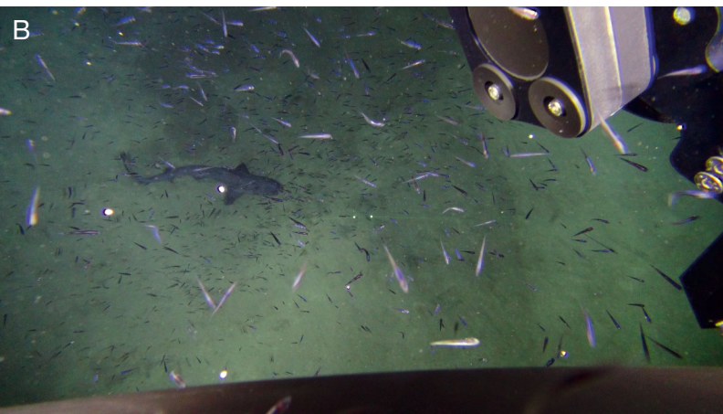
Fig. 2. Photos from the remotely operated vehicle (ROV) camera. (A) Fish swarming in the light of the ROV. (B) Fish that have been herded to the bottom. A shark in apparent feeding frenzy (tentatively idenfied as Lago omanensis ) is exploiting the high concentration of prey in the light of the ROV (see Video S1 in the Supplement)

pterotum is the predominant fish in catches from the lower layer and Vinciguerria in the layer above (Dypvik & Kaartvedt 2013, S. Kaartvedt unpubl. results). The visual observations were in accordance with such findings, although we could not make proper species identifications from the images. In addition, a few barracudinas (likely Lestrolepis sp.) appeared in the video footage.