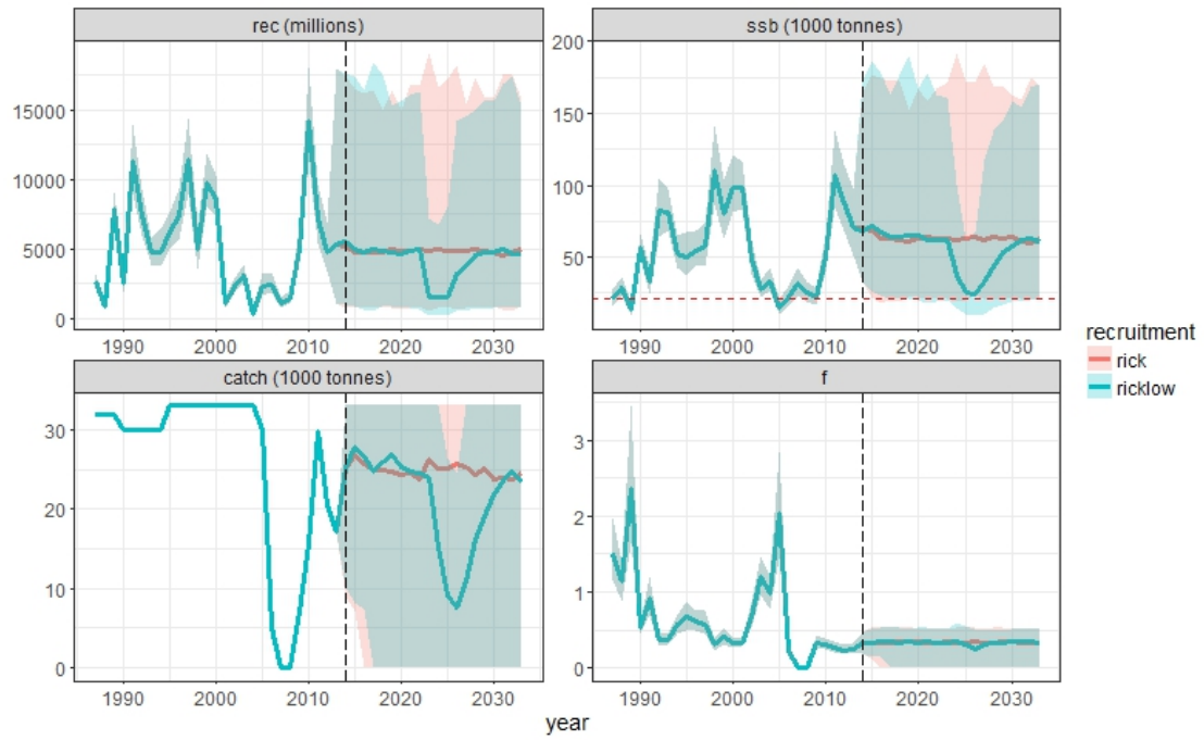
Figure S4. From top to bottom and from left to right recruitment (age 0 million of individuals at the beginning of the second semester), spawning stock biomass (in thousand tonnes), annual catch (thousand tonnes from January to December) and harvest rate (ratio between the annual catch and the spawning stock biomass) across years for Rule G3 with a harvest rate of 0.4 under different recruitment scenarios (in red, Ricker; and in green, Ricker with a low regime period of 3 years). The solid line represents the median and the shaded area the 90% confidence intervals computed from the 5 th and 95 th percentiles. The dashed vertical line is located at 2014, which is the first year of the projection period. The horizontal dashed red line in the second panel is the biomass reference point B_{lim} (set at 21,000 tonnes).