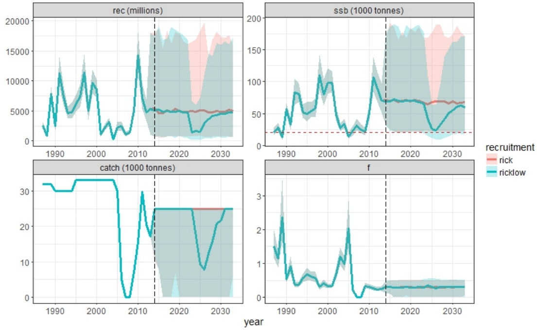
Figure S3. From top to bottom and from left to right recruitment (age 0 million of individuals at the beginning of the second semester), spawning stock biomass (in thousand tonnes), annual catch (thousand tonnes from January to December) and harvest rate (ratio between the annual catch and the spawning stock biomass) across years for Rule G4 with a harvest rate of 0.45 under different recruitment scenarios (in red, Ricker; and in green, Ricker with a low regime period of 3 years). The solid line represents the median and the shaded area the 90% confidence intervals computed from the 5 th and 95 th percentiles. The dashed vertical line is located at 2014, which is the first year of the projection period. The horizontal dashed red line in the second panel is the biomass reference point B_{lim} (set at 21,000 tonnes).

where \widehat{SSB}_y is the expected SSB during the management period (i.e. in year y ).